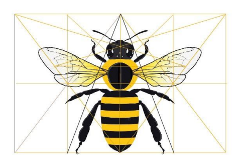
Figure 5. Analysis by Allok that bees were created based on the golden section.

If we analyze the bees from all sides. It is possible to see that Allah did not divide the bees in vain and that their forms were created based on the golden ratio and that Allah assigned them duties. (Fig. 5.) Bees start building a nest from different places at the same time and finish it at the same time. Architects are impressed by the high accuracy of building a house. (Fig. 6.)