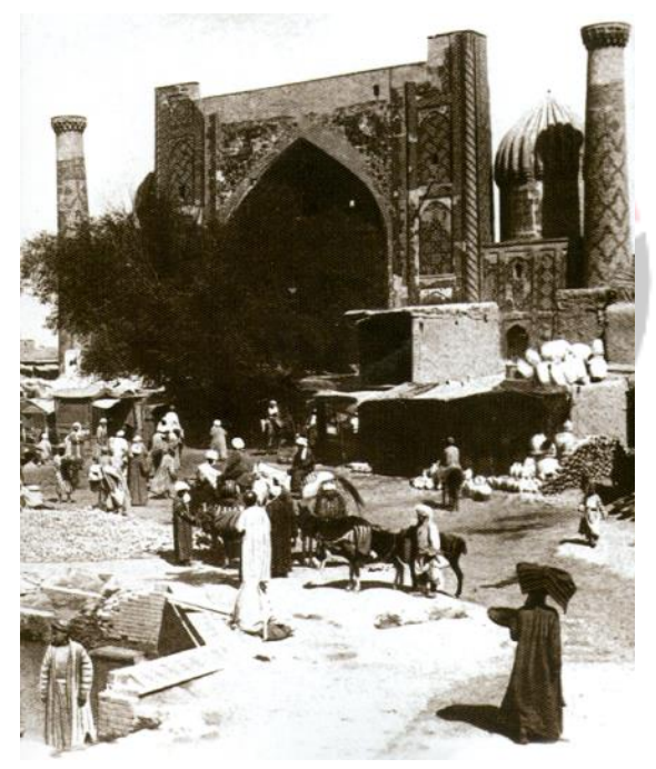
Figure 2. Sherdar madrasa. Early 20th century.

In his time, Yalangtosh Bahadir also built Sherdor and Tillakori madrasas in the place of the ruined house and caravanserai without destroying the structure of this building complex built by Ulugbek. In due course, I should also say that the gold spent inside the mosque of the Tillokor madrasa could be used to build a large monument (that's why the madrasa was called Tillakori, that is, "Made of gold").) [9].