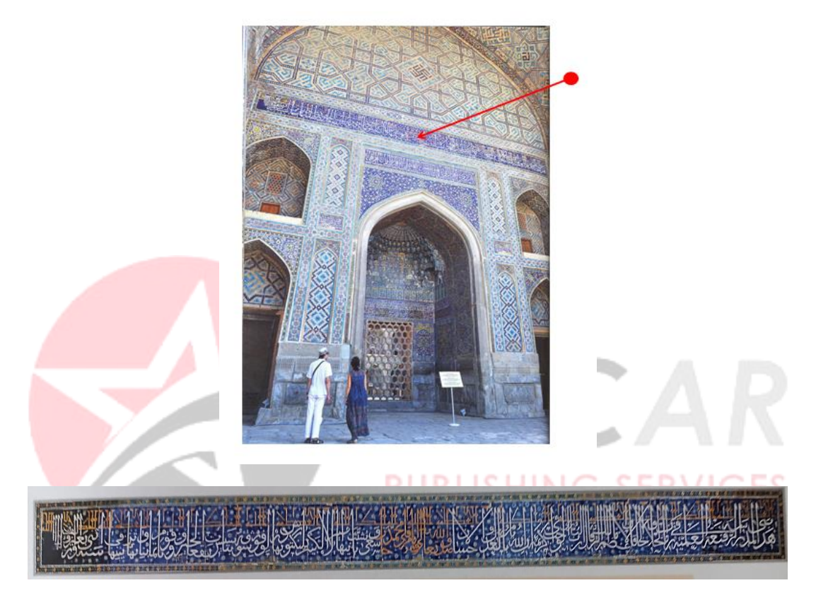
Figure 4. Sherdar Madrasa. Peshtokda Bakhshi inscription. Epigraphic description of Surah "Nahl" in the Holy Qur'an.

Nahl[14] of our holy book "Holy Qur'an" consists of 128 verses, and in its verses 68 and 69 it is said about bees: