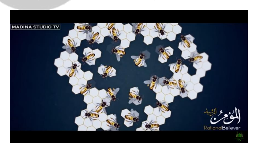
Figure 6. Bees start building a nest from different places at the same time and finish it at the same time. Architects are impressed by the high accuracy of building a house.

Let's look at the figurative meanings of these two verses. "Allah's revelation to animals, including bees, is considered to be his inspiration. Because Allah, the Exalted, created the bee with an emotion and inspiration, it performs its task with a precision that most intelligent people cannot do. Among other things, it makes a home for itself from mountains, trees, and things such as the trunks carried by people. [18]