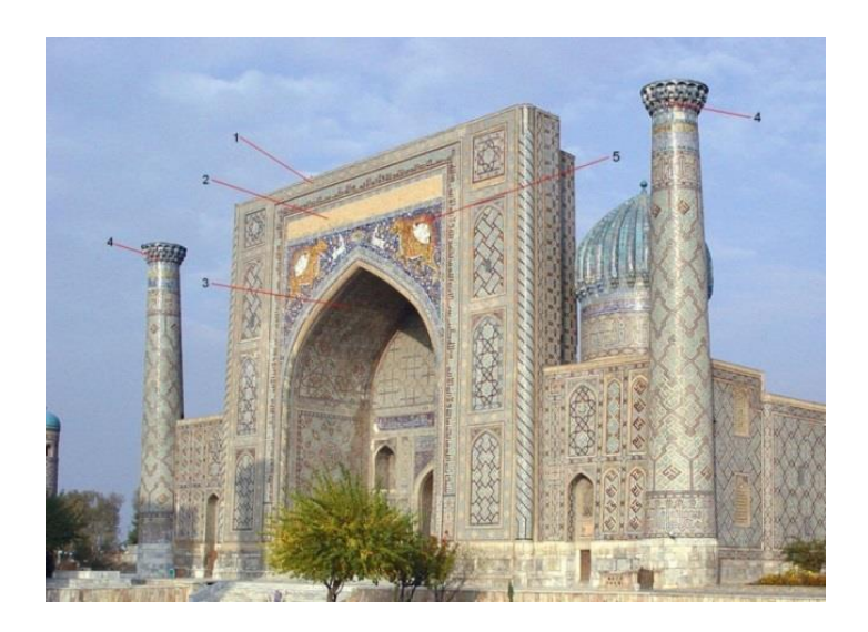
Figure 3. Naming of parts of Sherdar Madrasa. 1. Peshtok 2. Kitaba 3. Ravok 4. Bouquet 5. Kanos

Yalangtoshbi Bahadir, who built the Sherdar and Tillakori madrasas, was able to build more magnificent monuments. We are mentioning this word because of