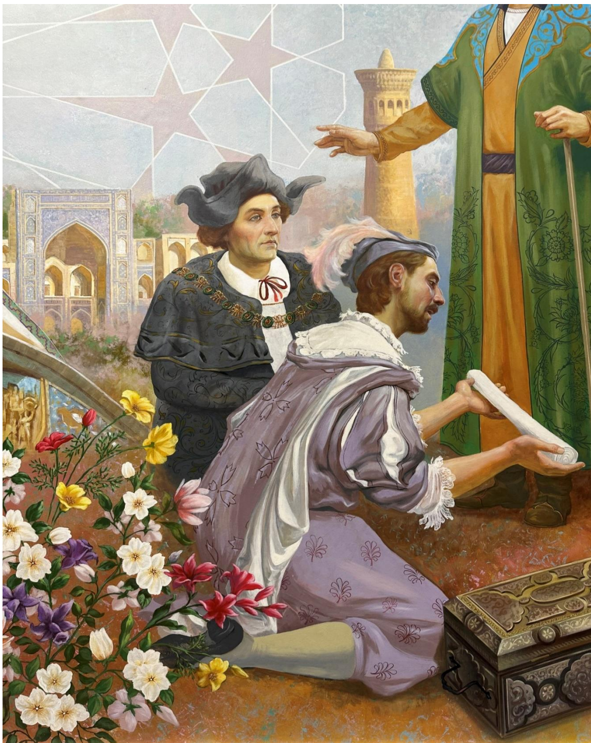
Detail. Gonzalez de Clavijo, the Spanish ambassadors.