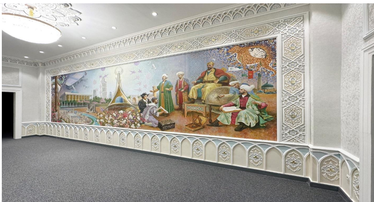
In the hall of the Legislative Chamber of the Oliy Majlis. Tashkent. Uzbekistan.

The leadership of the Legislative Chamber wishes him continued success in his artistic journey, confident that his future works will further enrich Uzbekistan's cultural heritage. New Uzbekistan is more than a painting—it is a celebration of a nation's heart and soul, captured on canvas for generations to come.