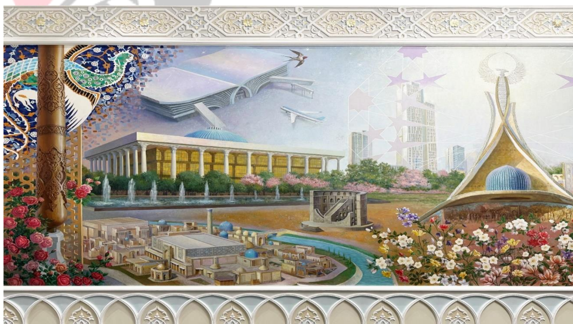
Detail. The Architectural compositions.