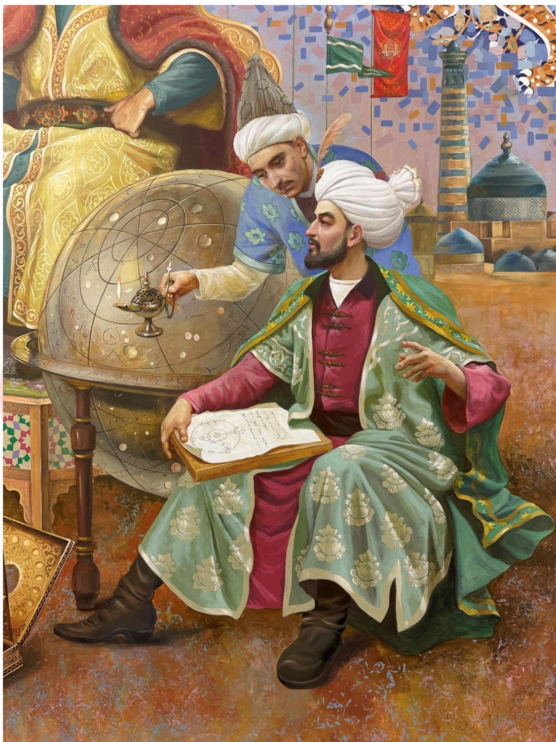
Detail. An astronomer Mirzo Ulugbek with mathematician Ali Qushchi.