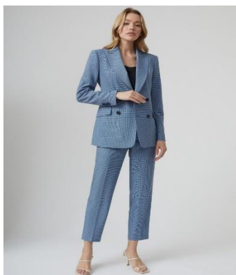
Figure 2. Women's dress in the classic direction

A classic clothing brand. Among the world's most famous classic clothes, Chanel takes the first place. She was once Mademoiselle Coco, who created the classic line. With his light hands, women and girls all over Europe, and then the whole world, a direction called classic appeared. Chanel brand classic women's clothing includes creating an image full of naturalness and elegance not only in clothes, but also in makeup, hair, shoes and accessories.