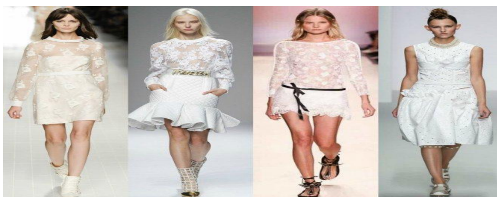
Figure 3. Women's dress in a romantic direction

The classic direction is primarily a direction of clothing with sophistication, simplicity of lines, and a harmonious cut. Products of this direction are distinguished by the quality of materials. Classic clothes are often black, brown, blue, gray, white. A check pattern with thin lines is common. The content and sizes are always familiar to the eye.