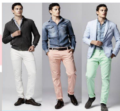
Figure 4. Men's clothing in a romantic direction

After all, it is incomparably classic with a choice of direction, suitable for people of all ages, so the delicate nature of the problem disappears much faster. Women's clothing in the romantic direction is characterized by air permeability and width.